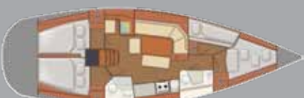
Interior Swing Version - 4 cabins