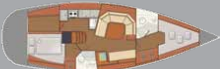
Interior Swing Version - 2 cabins