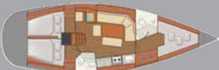
Interior Keel Version - 3 cabins