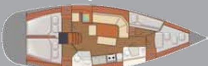
Interior Keel Version - 4 cabins