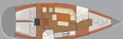
Interior Swing Version - 3 cabins