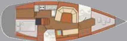
Interior Keel Version - 2 cabins